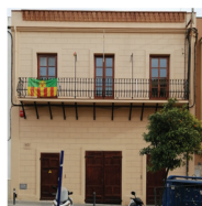
4 The Aliança