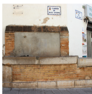
3 Fountain on Carrer Sant Antoni, trough fountain