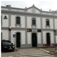
3 Cubelles train station