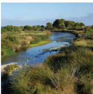
6 Foix River Estuary Protection