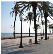
5 Seafront promenade