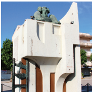
4 Charlie Rivel Monument