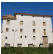
1 Cubelles Castle